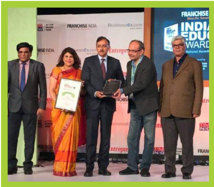
Sunbeam Eduserve Ltd. Has Awarded with Best K12 School Chain of the year (North) at The Indian Education Awards 2017