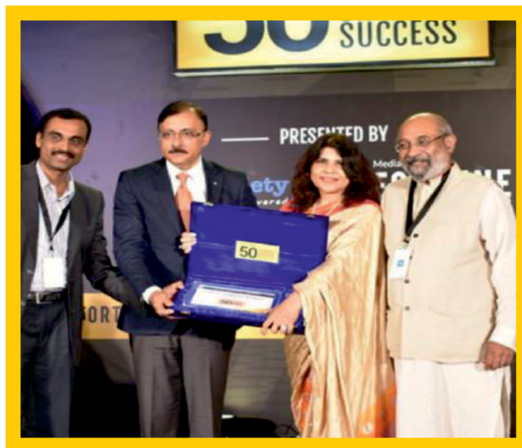
Sunbeam Group of Educational Institutions Varanasi Sunbeam Bhagwanpur, Sunbeam Lahartara and Sunbeam Varuna Has prestigious recognition of being part of TOP 50 future Schools shaping success by Forbes International Magazines