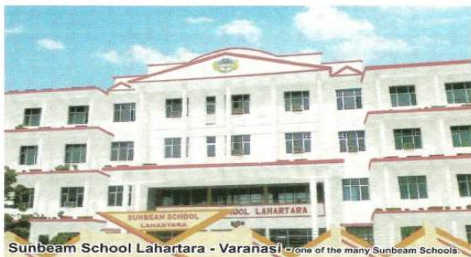
Sunbeam School Lahartara - Varanasi - one of the many Sunbeam Schools.

Mark Twain once said, Varanasi is "older than history, older than tradition, older than legend, looks twice as old as all of them put together." This is the city where vast riches of Indian music, art and dance cultures took birth. The city of light, Varanasi since ancient times, has been the capital of all knowledge (Sarva Vidya ki rajdhani). Today, Sunbeam Group of Educational Institutions, continues to uphold the glorious tradition of knowledge dissemination through the temples of learning i.e. the Sunbeam Schools situated in Varanasi and in other cities of Uttar Pradesh.