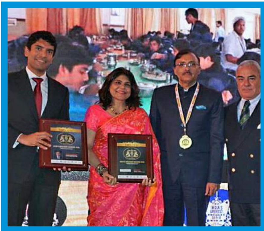
Sunbeam Group of Educational Institutions Recognized as one of Asia's 100 greatest brands and leaders for 2016 by Asia One Magazine and URS Media Consulting Pvt. Ltd. based out of Singapore