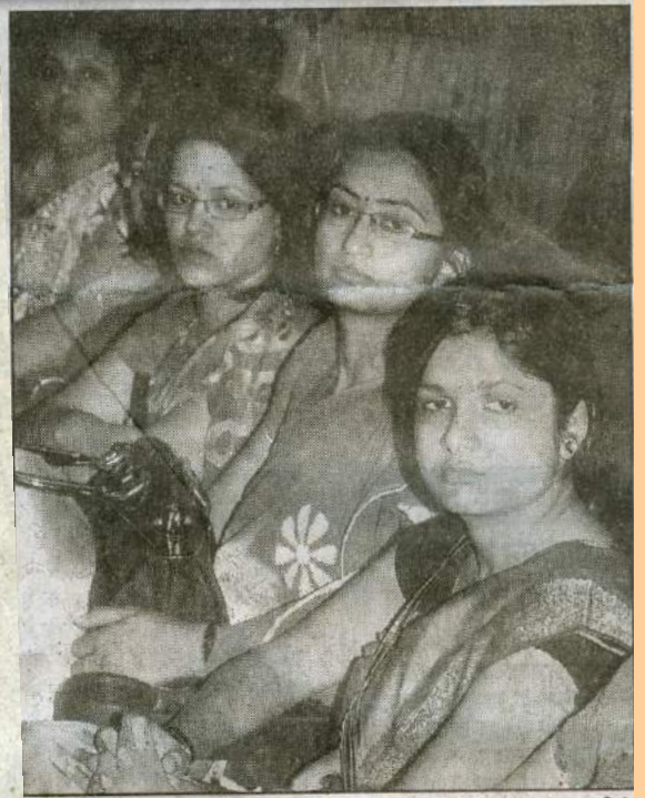
सनबीम स्कूल के कार्यक्रम में अभिभावकों ने बाल मन से सामंजस्य बैठाने के गुर सीखे